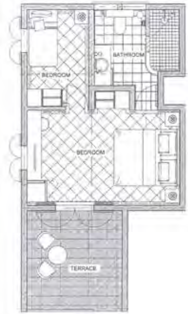
COMFORT - FAMILY